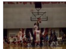
Harvard-Westlake - Loyola...