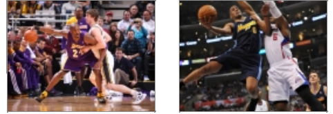
Lakers Fall to Heat Clippers vs Nuggets