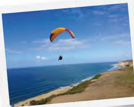
Don't miss Torrey Pines Gliderport, America's most popular coastal-soaring site.

that provide comfortable, exquisite dining. Offering seasonal Southern California cuisine with rancho influences, Adobe El Restaurante is perfect for breakfast and lunch.