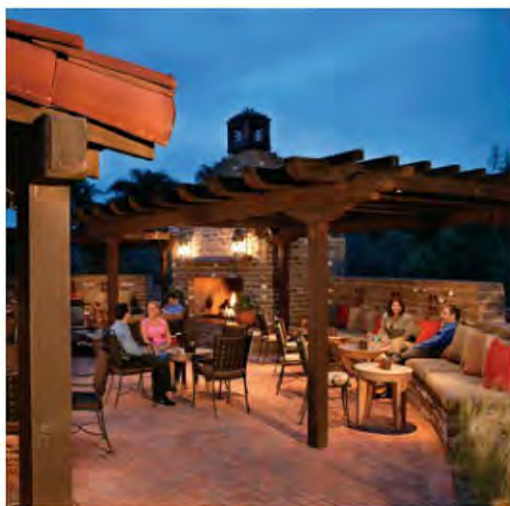
The architectural design captures Southern California's past.