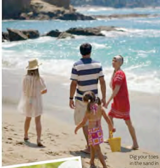
Dig your toes in the sand in Laguna Beach.

After that, take a walk down to the beach and explore the tide pools. Next, Mom and Dad can enjoy a spa treatment (always divine), while the kids get creative at Paintbox, the activities-based children's program. Finally, everyone can meet to watch the sunset and play checkers in the Lobby Lounge. montagelagunabeach.com