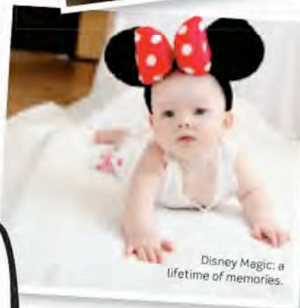
Disney Magic: a lifetime of memories.