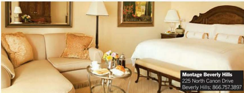
Montage Beverly Hills 225 North Canon Drive Beverly Hills; 866.757.3897

A visit to Montage's spa is essential. It's not just any spa – it's a two-floor, 20,000-square-foot land of rest and relaxation. The treatments are progressive, the design is decadent, and details (such as salts from the Dead Sea) are exotic. Spa Montage offers several wet treatments. For example, its Anointing Treatment is probably nothing you've ever experienced. Your anointing starts with rose oil, applied in a figure-8 pattern, which is reputed to balance the energy system over your chakras. Your therapist then gives a full-body massage, and the treatment ends with a "Vichy rain shower," composed of hot- and cold-water streams that travel up and down your spine to boost metabolism and detoxify your body. It results in physical nirvana and