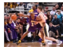
Lakers Fall In Utah