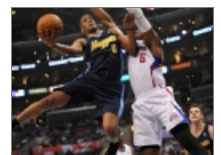
Clippers v Nuggets