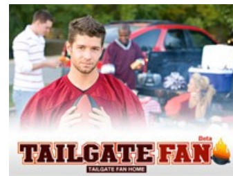
Create A Tailgate & Invite