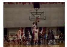
Harvard-Westlake - Loyola...