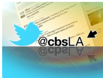
Follow Us On Twitter