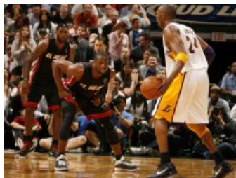
NBA Power Rankings